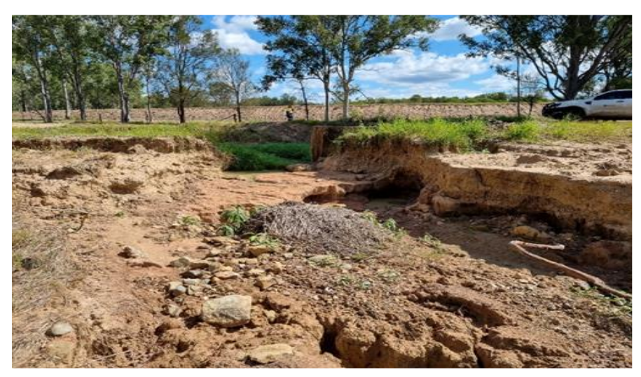
Figure 4: Washout damage on Brightview Channel