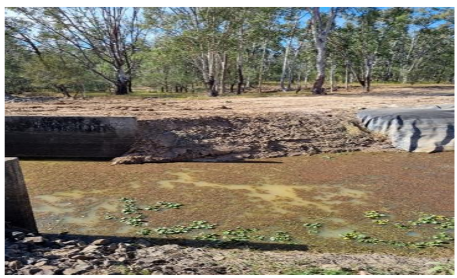
Figure 5: Repair works on washout Brightview Channel