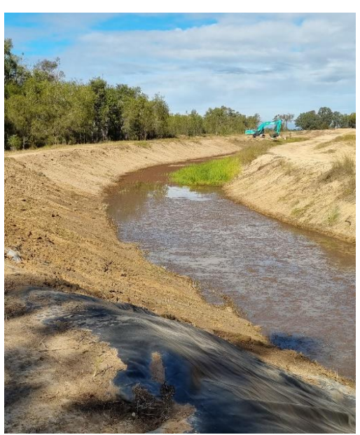
Figure 6: Post flood cleaning and repair works on Brightview Channel