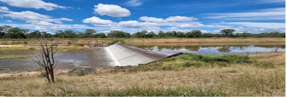
Figure 1: Atkinson Dam spilling March 2022