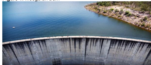
Figure 1: Moogerah Dam

Moogerah Dam started the 2021-22 water year with an announced allocation of 77% due to the 41.6% capacity held in storage. The AA% then increased to 100% on the 1 December as a result of significant inflows.