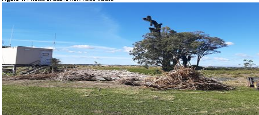
Figure 4: Photos of debris from flood waters

The Operations Team were kept busy during 2021-22 with routine maintenance works post flood tidying and completing track repairs at Junction Weir. Some sensus meters have been replaced and 60 additional meters were upgraded.