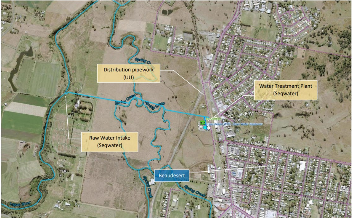
Figure 1 Beaudesert Water Supply Overview

Beaudesert is located within the Scenic Rim Regional Council (SRRC) local government area. The primary water source for the town is the Logan River supported by releases from Maroon Dam (refer Figure 1).