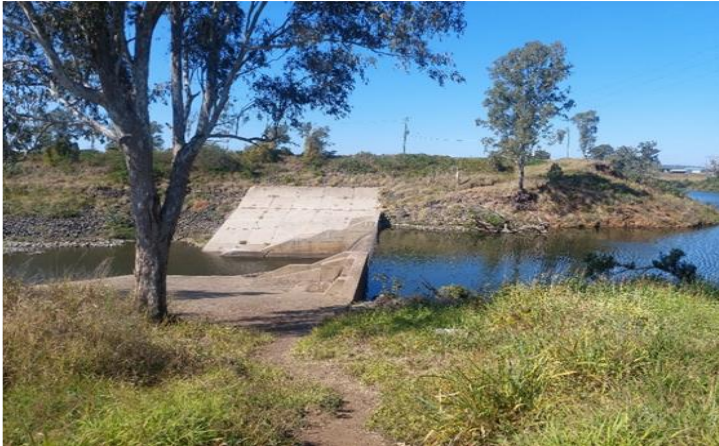
Figure 1: Repairs are still underway at O'Reillys Weir