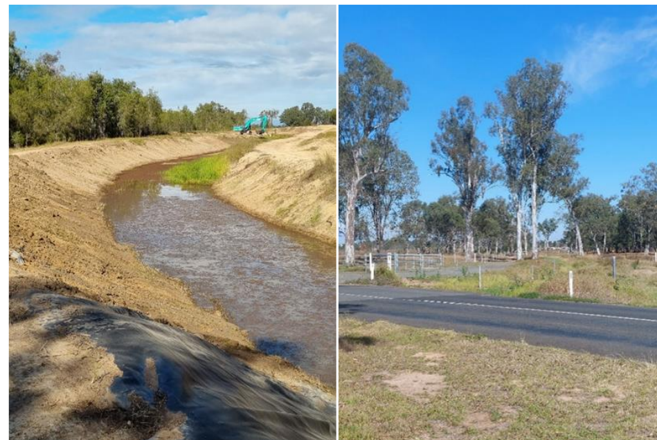
Figure 3: Post Flood cleaning and repair works on Brightview and BR1 Channels

The operational team continued to focus on ongoing operation and maintenance of the scheme, including Dam Surveillance activities, continued maintenance and upkeep of channels, delivery of water and weed mitigation programs across all areas. Our biosecurity officers are developing a plan to undertake targeted weed control spraying including hyacinth within the gravity channel and giant rats tail grass in the Seven Mile channel areas.