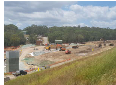
The main area of the construction site, January 2019.