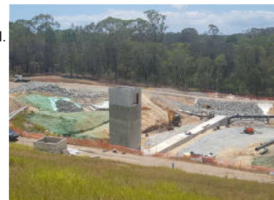
The new access tower is almost complete. The conduit (tunnel) has been extended to the width of the new weighting berm.