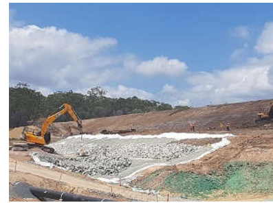
Massive drains will carry water around the dam wall to protect it from erosion.

Thank you for your patience and understanding while this essential work is carried out.