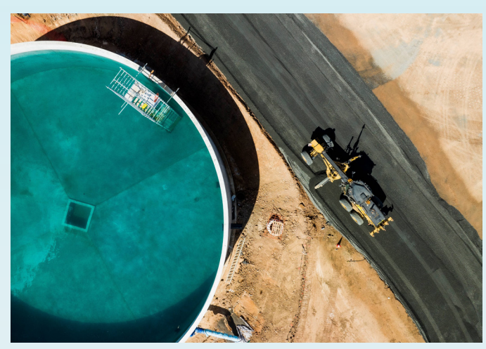
Construction of the South West Pipeline Wyaralong Transfer Station